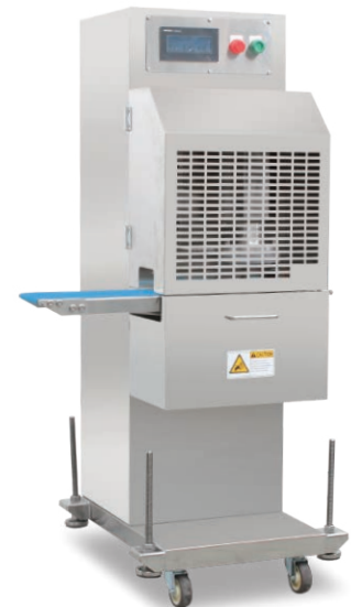
▲ Heat Stamper

The specifications are subject to change without notice and without obligation.