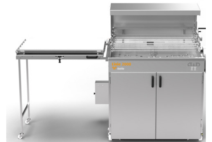
OPTIONAL: INTEGRATED FERMENTATION CHAMBER